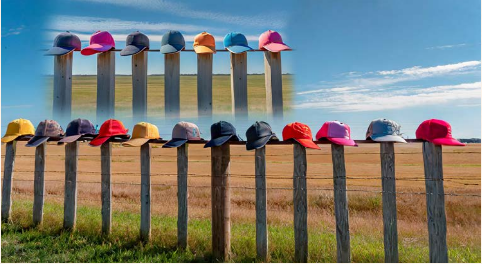
Age Nâpchûwîk (19). Tesna age nâpchûwîk (19 hats).