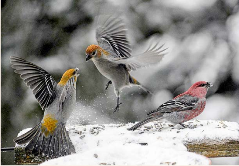
Yamni (3). Thiktabîn yamni (3 birds ).