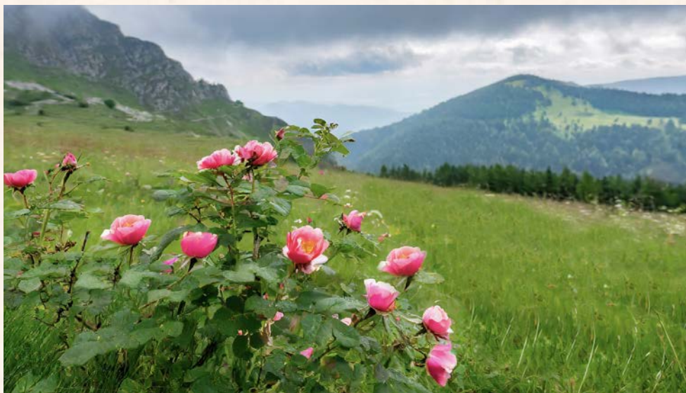
Age Yamnî (13). Woya Age Yamnî (13 flowers).