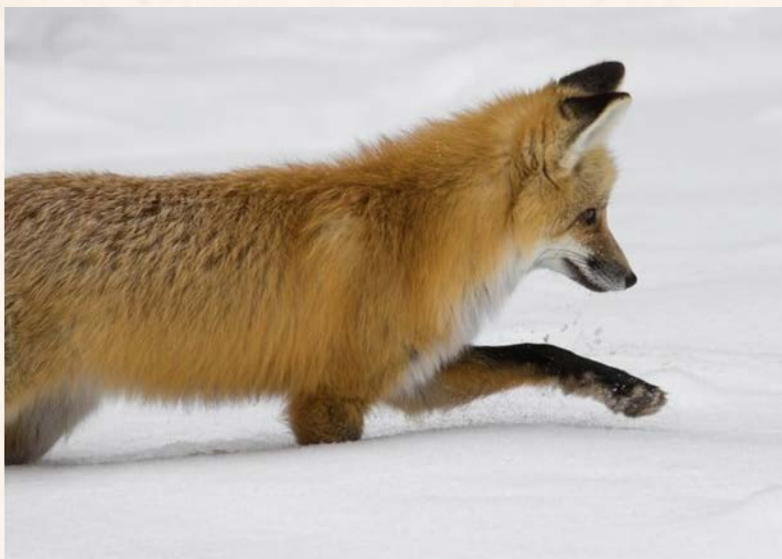
Wazi (1). Tokân wazi (1 fox).