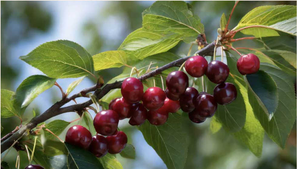
Wîkchemnâ Nûm (20). Châpa wîkchemnâ nûm (20 chokecherries).