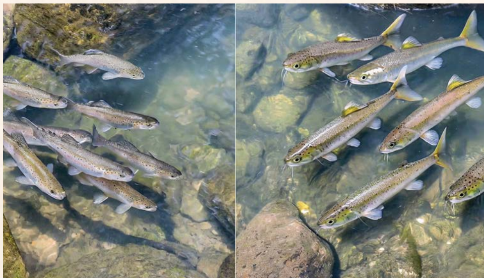
Age Ktûtha (14). Horhâ age ktûtha (14 fish).