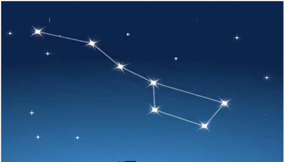
Age Sakpe (16). Yarhyâigên age sakpe (16 stars).