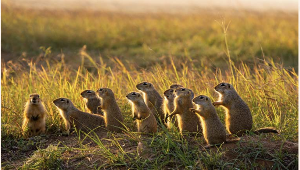
Age Wazi (11). Pithên age wazi (11 gophers).