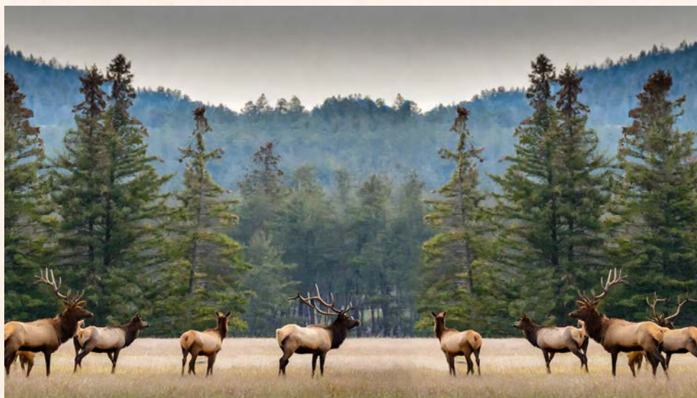
Wîkchemna (10). Pachedên Wîkchemna (10 elk).