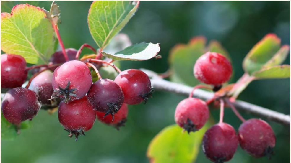
Age Nûm (12). Wobathokâ age nûm (12 Saskatoon berries).