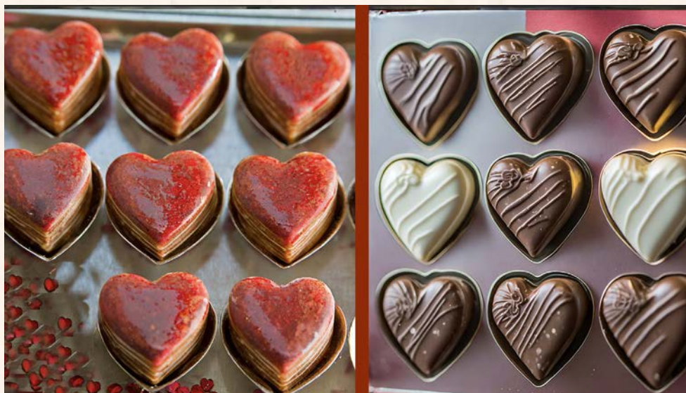
Age Sagowî (17). Châde age sagowî (17 hearts).