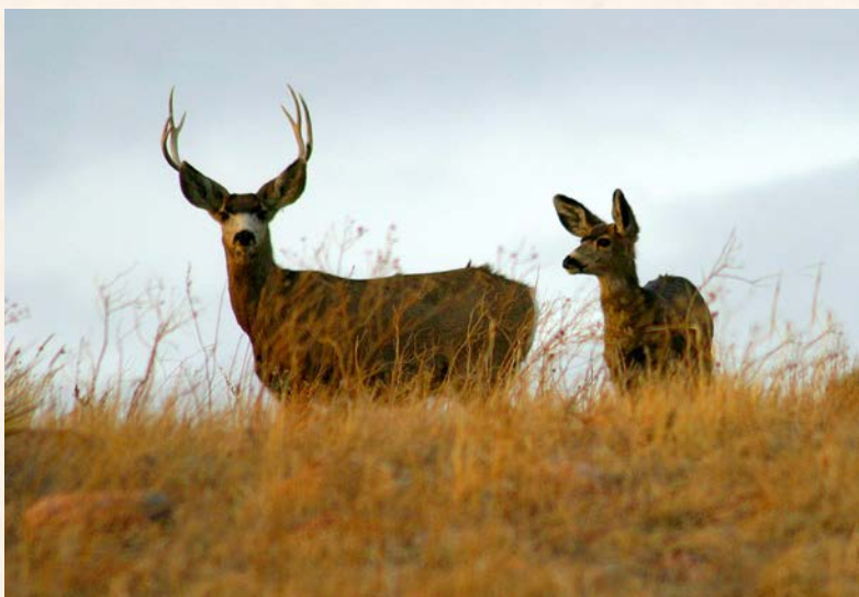
Num (2). Thîde thabân nûm (2 black-tail deer).