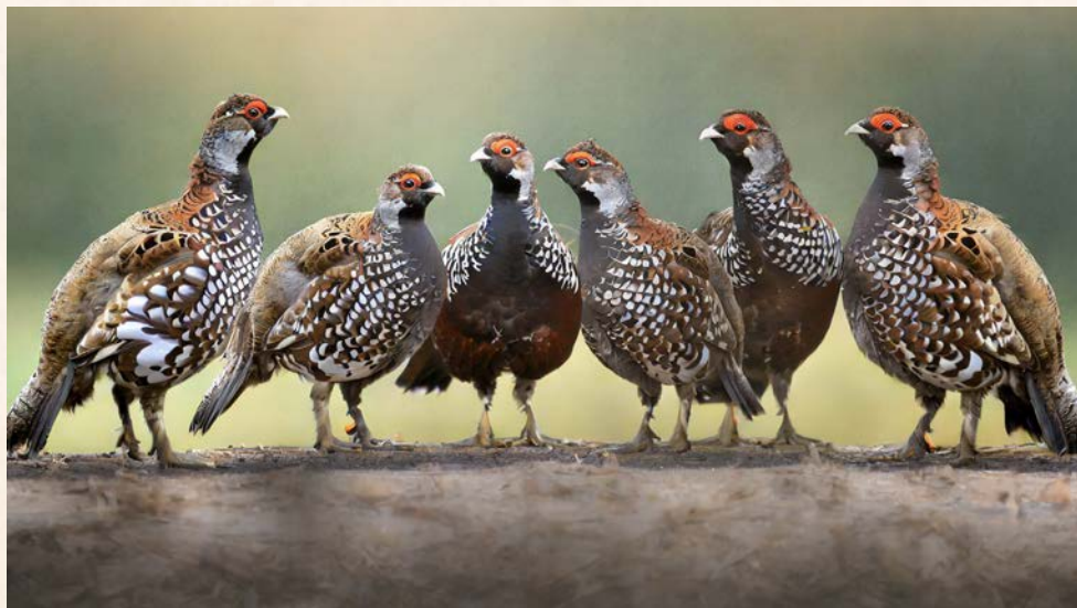
Wîkchemna (6). Thicha Wîkchemna (6 grouse ).