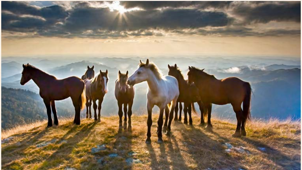
Sarhnora (8). Sûwa tâga sarhnora (8 horses ).