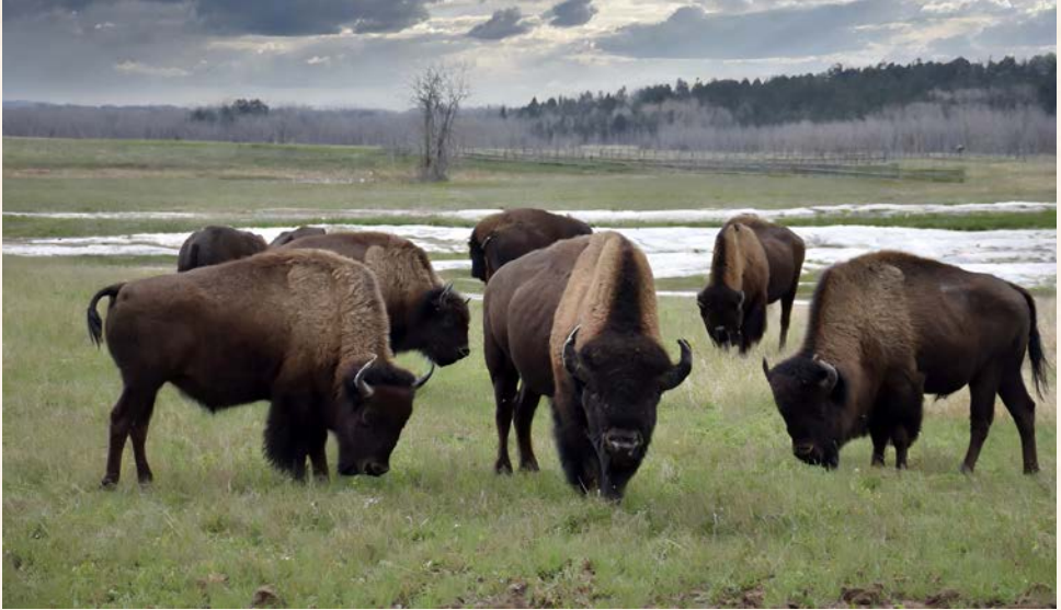
Sagowi (7). Tatâga sagowi (7 bison ).