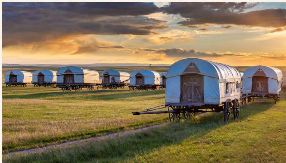
Nâpchûwîk (9). Châohmîhmâ nâpchûwîk (9 wagons).