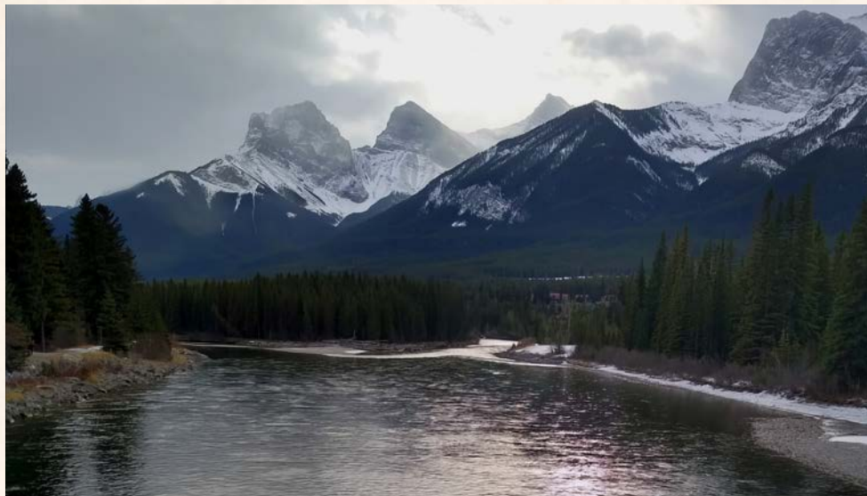
Thapta (5) Îyarthe thapta (5 mountains ).