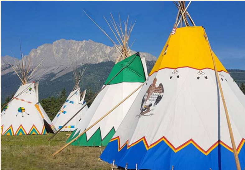
Ktûtha (4). Keyabi tâga ktûtha (4 tipis ).