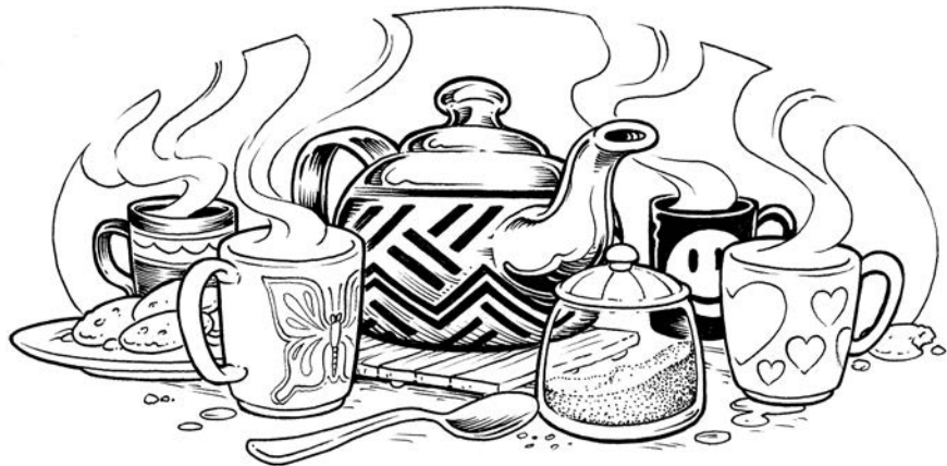
Part 3 Illustration