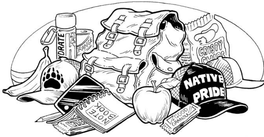
Part I Illustration