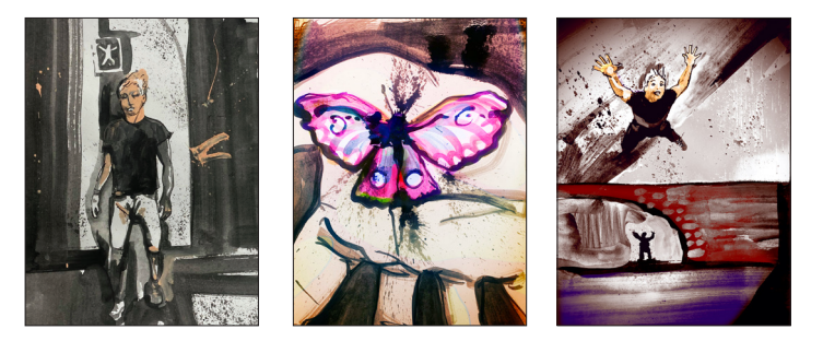
Responding to popular demand , Rich Théroux's River Troll is back with a special edition in full color

BEYOND THE BOOK FEATURE: QR Codes to Illustration Animations!